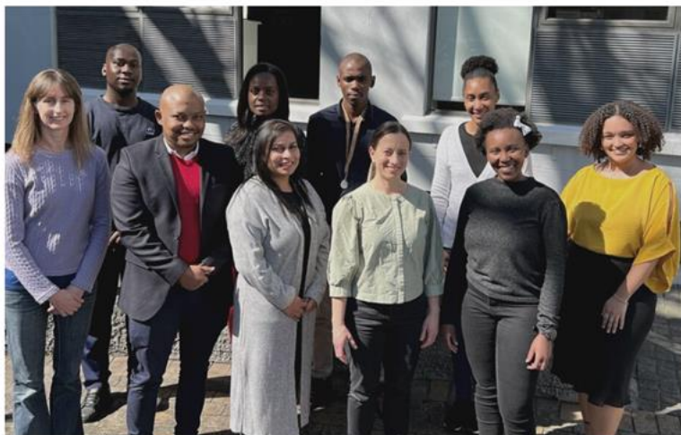
Delegates who attended the UCT CIS Short Course (top) and UCT IMACS Short Course in August (bottom).

The following online Investment Sprints were delivered: