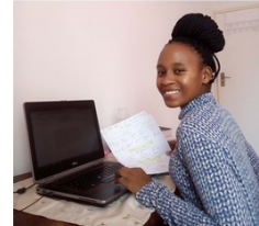
IMACS@TSIBA students studying from home with their new laptops