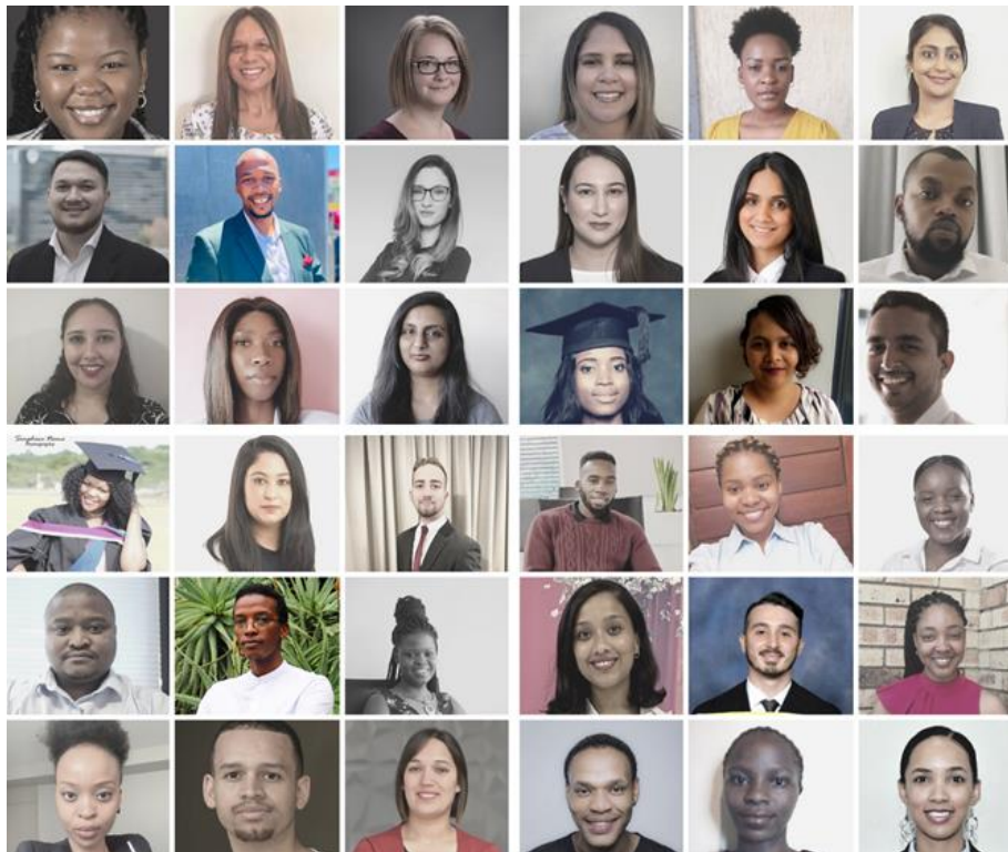
Some of the graduates that attended the virtual graduation ceremony