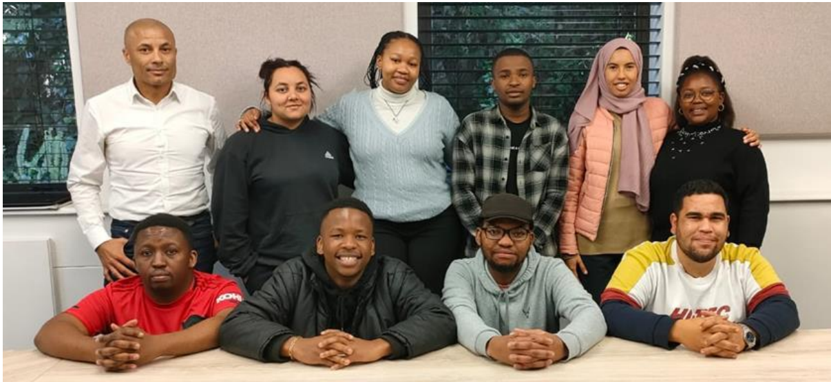
2022/23 ASISA Academy IMACS@TSiBA Internship 12th cohort.

We are excited that 10 students in the second year of their TSiBA Bachelor in Business Administration degree (Finance) started their learning journey with us on Friday, 29 July. These students are sponsored by M&G Investments, Taquanta Asset Managers, Prescient, Coronation Fund Managers, Intembeko Investment Administrators, Allan Gray, Citadel Investment Services and PSG.