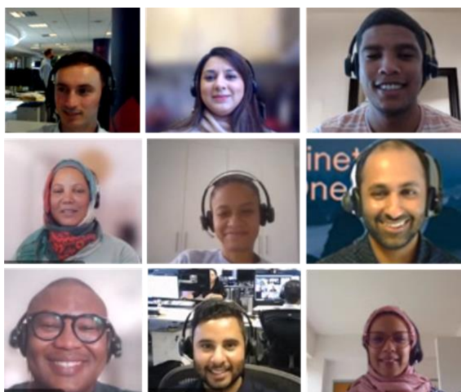
Delegates who attended one of the bespoke Investment Sprints in February

For an overview of learning opportunities lined up for 2022, please visit the ASISA Academy 2022 Learning Calendar .